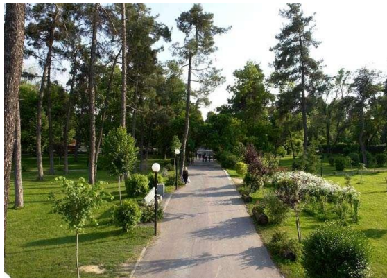
Figure 2. Representative view of Pafsilipo Park

Pafsilipo offers unique opportunities for multiple activities, which exceed the touristic ones. Visitors can find a place for rest, relax and productivity (Dreyer, 2004; Kaiser, 2004). In this context, Pafsilipo combines alternative values, which vary from aesthetics, usability, a place of reference for urban planning and an open meeting place (Paganos, 2002). A variety of trees, bushes, flowers and a zoo can be found in Pafsilipo, which offer a natural beauty that is not seasonal but lasts during the entire year.